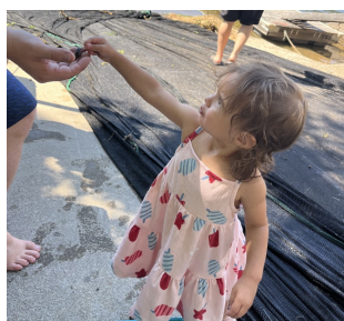
Setting up, moving, maintaining, and cleaning the fish pens is a multi-age Santora family affair!